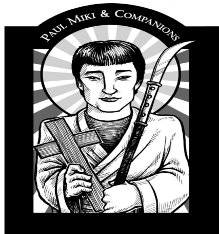
Paul Miki was a Japanese Jesuit priest who was well known for his preaching. During his life the number of Christians in Japan was steadily growing. This displeased the Japanese ruler, Hideyoshi. He ordered the execution of Paul Miki and 25 of his companions. They were all crucified near Nagasaki in 1597; the first Christian martyrs in Japan. It is said that Paul Miki gave his last sermon from the cross, during which he forgave his persecutors as Christ had done.