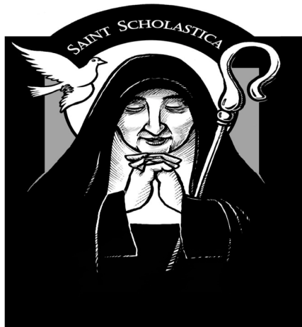
S t Scholastica was born in 480 AD and was the sister of St Benedict. Her life was dedicated to God from an early age and she later founded the order of Benedictine nuns. Scholastica met her brother once a year at a house near his monastery. According to the writings of Gregory the Great, on their last visit she asked Benedict to stay longer but he refused. She began to pray for rain and a fierce storm erupted which prevented him from leaving the house. She died three days later and tradition says that Benedict saw his sister's soul leave her body in the form of a dove.